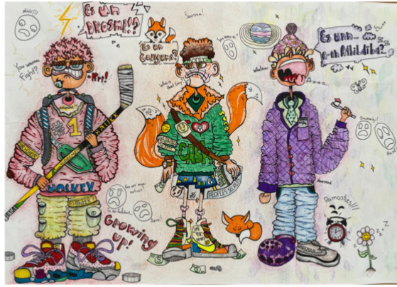
DANIĻA ANČIPANOVŠ, 18 gadi, Daugavpils 9. vidusskola "Es ar sevi". Dzīvē ir daudz situāciju, kurās cilvēks var ieraudzīt savu isto "es".